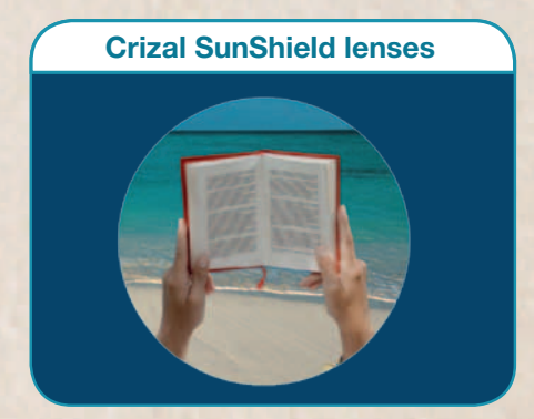
With Crizal SunShield, glare is eliminated, and comfort increased