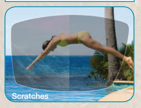
Ordinary sun Crizal SunShield lens

Crizal SunShield protects clear vision by resisting scratches and smudges, and repelling water and dust.