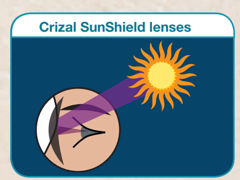
Backside UV reflections are reduced for 360° UV protection.

That has changed with Crizal SunShield™ the first and only No-Glare sun lens offering 360° UV protection. By reducing backside UV reflections, Crizal SunShield provides you safer vision.