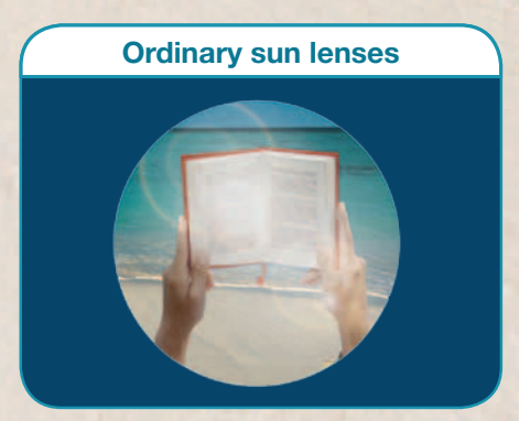
On ordinary sun lenses, light is reflected from the back surface, causing glare